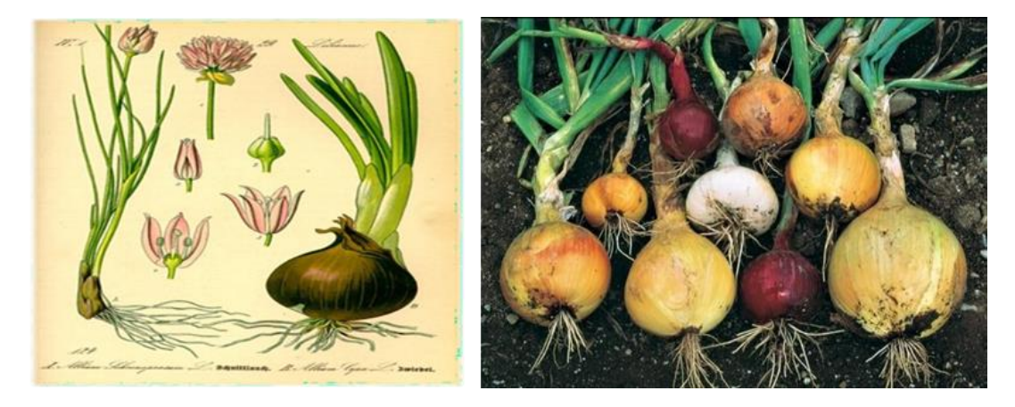
Figure 1 Allium cepa.L

Onion belongs to the family Amaryllidaceae; the plant is either biannual or perennial (depending on the cultivar), and smells when crushed<sup>7</sup>. The plant has shallow adventitious fibrous roots, bulb, and tubular leaves. The stem grows 100–200 cm tall during the second year of the plant's life. The green leaves of the plant are an extension of the outer food storage leaves. The inflorescence is umbel-like and develops from a ring-like apical meristem<sup>8</sup>. The umbel is the aggregation of flowers at various stages of development, and it contains 200–600 small individual flowers, although this number can range from 50 to 1000<sup>9</sup>. It is composed of white or greenish-white small flowers which grow at the tip of the stem in the second year of the plant. The onion bulb ranges in shape from flat to globular to oblong, and the onions are usually of three colors: red, white, and yellow <sup>10</sup>. The fruits are capsule and contain black seeds. The bulb is composed of fleshy and enlarged leaf bases. The edible onion bulb can grow up to 10 cm in diameter, and it is composed of several overlapping layers on a central core. The outer leaf bases of the bulb lose moisture and become scaly by the time of harvesting, and the inner leaves thicken as the bulb develops. The majority of the species of onion grow in open, sunny, and dry land, mainly in humid climates. However, the Allium species have been adopted in other ecological niches of the world <sup>11</sup>.