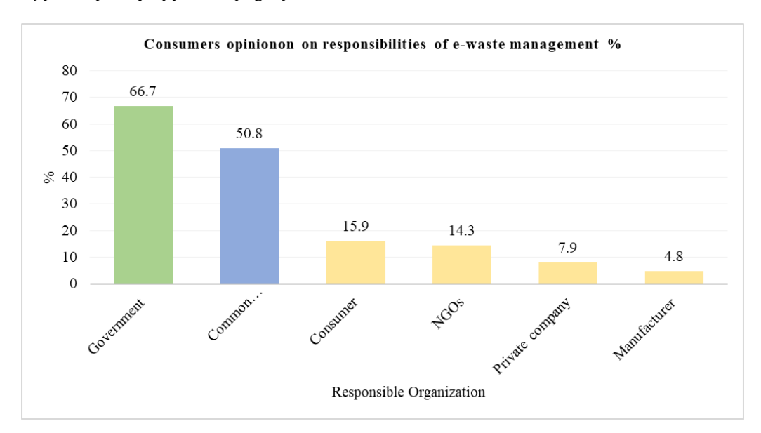
Figure 3 Consumers opinion on responsibilities of e-waste management

96.8% of the respondent thinks it is a problem in Bangladesh of the proper management of the electronic waste. As well as 95.2% of the respondent think it the proper time for concerning about proper management of e-waste. 95.2% of the respondent like to be involved in setting up a responsible and safe recycling scheme in our country. Most of the consumers give multiple opinion on the management of e-waste. 66.7% of the consumers think government, 4.8% consumers think manufacturer, 15.9% consumers think consumers, 14.3% NGOs, 7.9% private company should take responsibilities of the management of e-electronics. As well as 50.8% consumers opinion to manage e-waste in common responsibilities/participatory approach (Fig. 3).