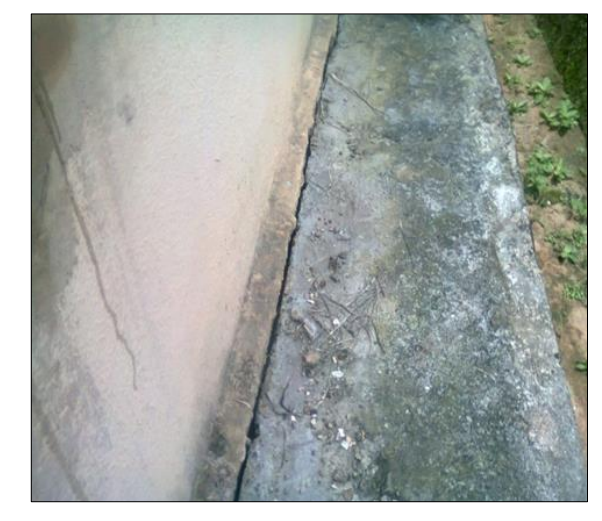
Plate 2 Crack and Dampness at the Foundation