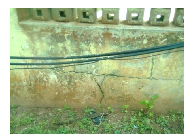
Plate 3 Longitudinal, Vertical and Diagonal Cracks; Source: Researchers field study (2018)