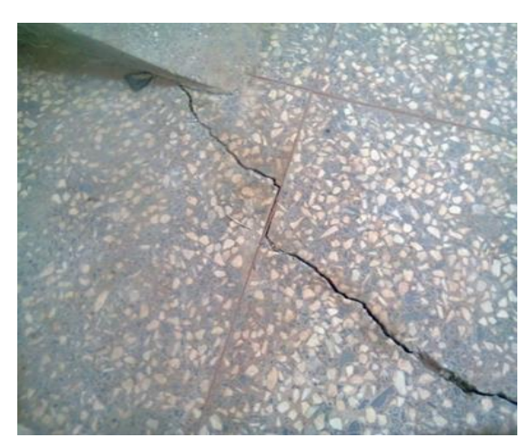
Plate 4 Cracked Floor on Building