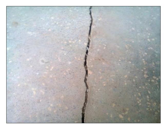
Plate 5 Cracked Floor Slab; Source: Researchers field study (2018)