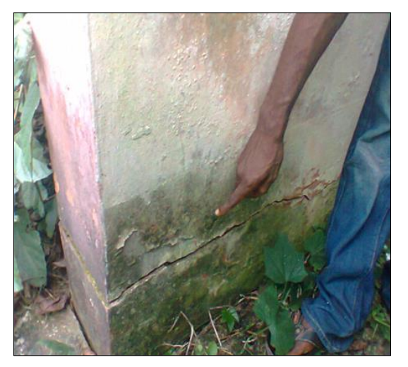
Plate 1 Longitudinal Crack and Dampness at the Foundation

4.4. Plates 1-6 Showing Photographs of Maintenance Problems in the Institution