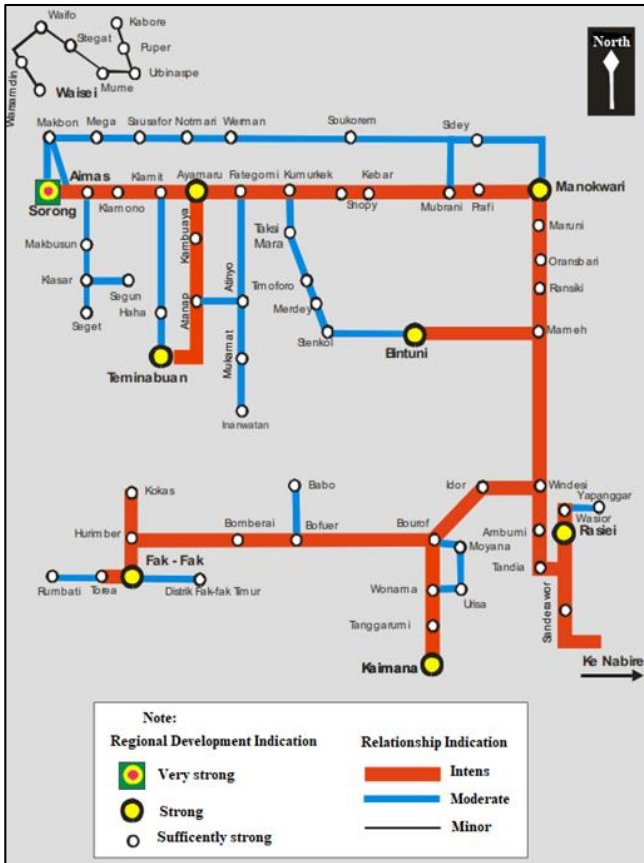
Figure 2 RNS proposed by Central Government