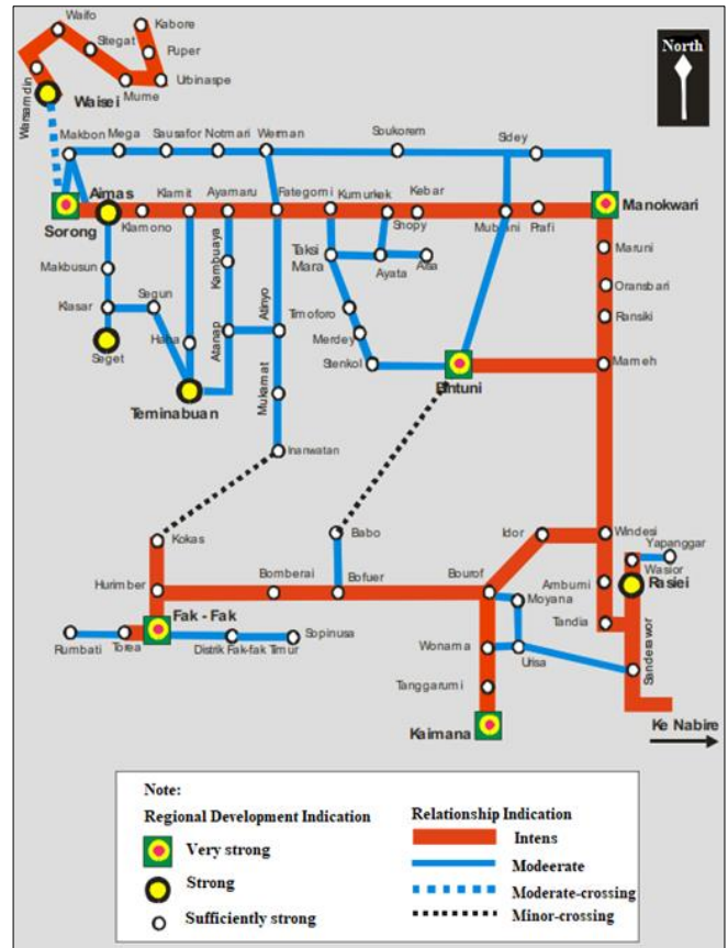
Figure 3 RNS proposed by local and national