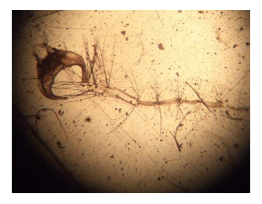
Figure 2 Decomposition Head and Abdomen of C. quinquefasciastus

The effect of treatment with Leaf extracts of Az. Indica and S-Hydroprene on the morphology of the organisms was in form of abnormalities on the body wall and chitinous exoskeleton (Figures 2, 3 and 4). These effects were not observed in the control group (Figure 5).