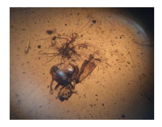
Figure 3 Decomposing body parts of C. quinquefasciastus