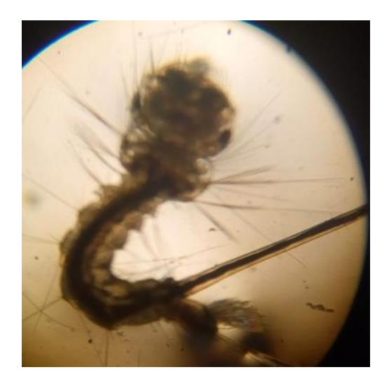
Figure 5 Control

Figure 2 – 5: Morphological effect of Azadirachta indica (10 mg/L to 60 mg/L) and S-Hydroprene (10 mg/L to 60 mg/L) on experimental and control groups of first instar larvae of Culex quinquefasciastus