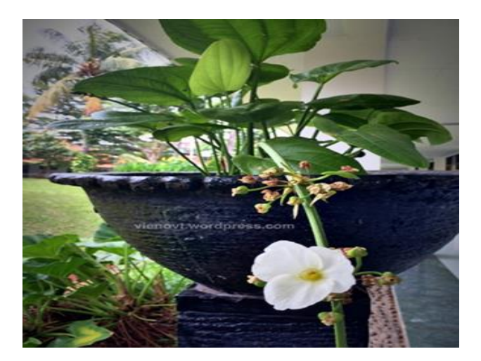
Figure 1 Echinodorus palaefolius (Water Jasmine) plant