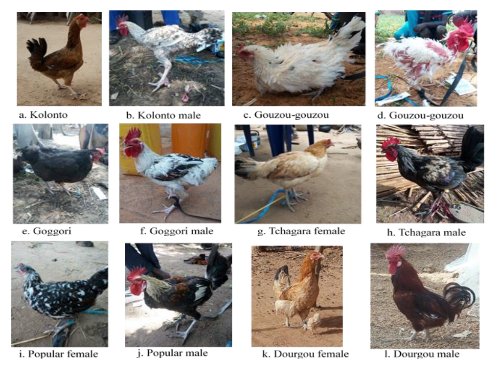
Figure 3 The different ecotypes of local chicken in Niger