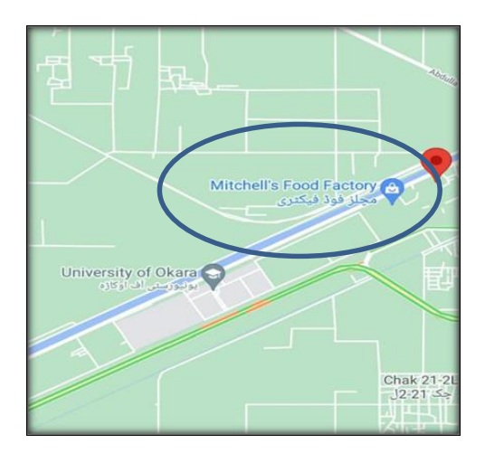
Figure 1 Location of Mitchel farm at Google map

This study was conducted in winter; November 2021 at Mitchell Farm located at Renala khurd near the University of Okara, Pakistan, to observe and relate the diversity and sequential relationship of insects among different food crops i.e. Mustard, Tomato and Potato in winter season.