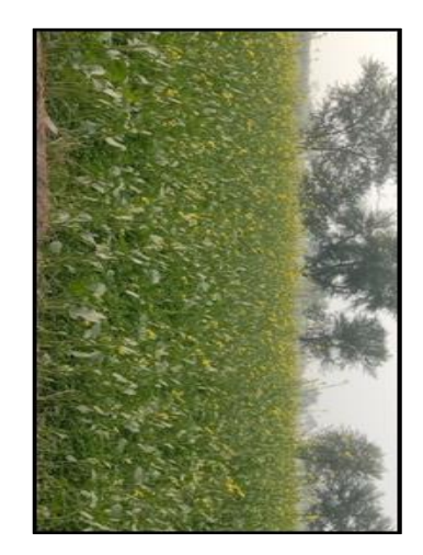
c) Mustard field