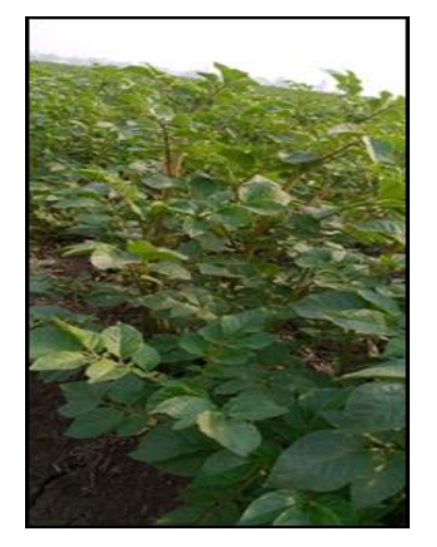
Figure 2 a) Potato field