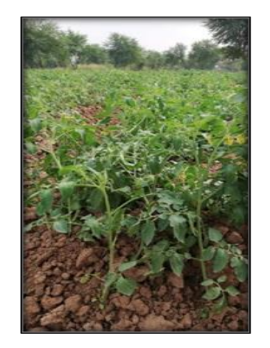
b) Tomato field