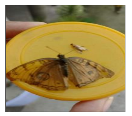
b) Aglais Urticae