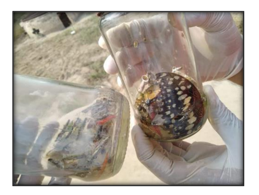
Figure 3 a) Collected specimens

To collect the specimens of Foliage, Aerial and Ground insects on Mustard, Tomato and Potato quadrant method was used; samples were collected once from an area of an Acre from each field. It is suggested that samples should be collected between early morning or late evening to record more abundance. Common tools were used to collect the specimens i.e. hand picking, aerial nets, sweep nets and forceps, After collection the samples were brought to the Laboratory of general zoology to preserve them.