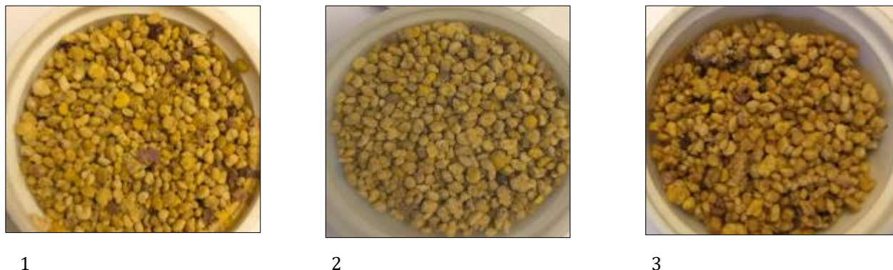
Figure 2 1. Natural bee pollen (initial material); 2. Bee bread processed; 3. Mix of bee bread with chestnut honey.

According to the preliminary results of the biochemical study, no deterioration of the indicators was observed during the processing of the bee bread material. According to the results of microbiological research, the product retains its biological activity, evidenced by the morphological indicators of pollen and bee bread (see photos).