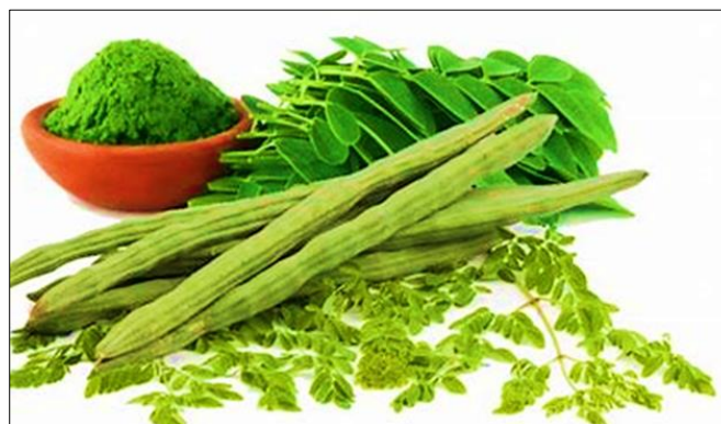
Figure 3 Parts of Moringa Oleifera plant

The moringa plant can be grown as a perennial or annual plant. All pods are edible throughout the early stages of plant development, but as the plant matures, the pods become bitter and inedible. When cultivated perennially, moringa benefits less favourable growing environments by reducing erosion and stabilising agroforestry[10].