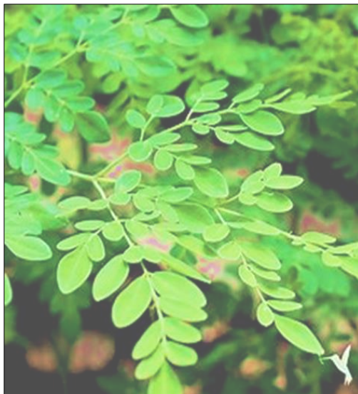
Figure 1 Leaf of Moringa Oleifera