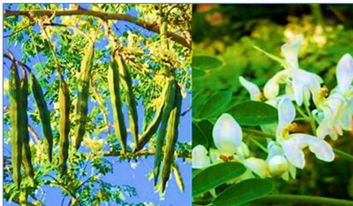
Figure 4 Flowers of Moringa oleifera

On thin, hairy stalks, the fragrant, bisexual, yellowish-white flowers are produced in spreading or drooping panicles (clusters) that are 10–25 cm long. Individual flowers range in size from 0.7 to 1 cm long and 2 cm wide, with five uneven yellowish-white, thinly veined, spathulate petals, five stamens, five smaller sterile stamens (staminodes), and a pistil