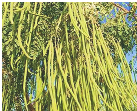
Figure 2 Fruits of Moringa Oleifera

A short, slender, deciduous, perennial tree, M. oleifera grows to a height of about 10 m, is rather slender, and has branches that droop; the branches and stem are brittle, and the bark is corky; the leaves are feathery, pale green, compound, tripinnate, and have many small leaflets that are 1.3-2 cm long and 0.6-0.3 cm wide, with the lateral ones being somewhat elliptic and the terminal. Flowers are fragrant, white or creamy-white, 2.5 cm in diameter, borne in sprays, and have five (5) stamens at the top of each flower. Pods are pendulous, brown, triangular, splitting lengthwise into three parts when dry, (30-120 cm long, 1.8 cm wide), and contain about 20 seeds embedded in the pith. The seeds are dark brown, the pod is nine (9) ribbed, and it tapers at both ends[2].