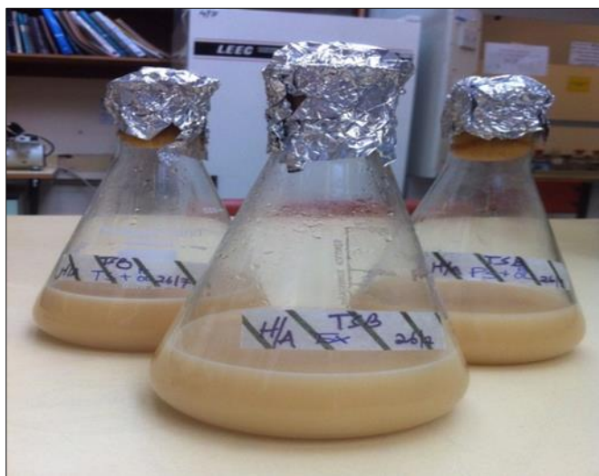
Figure 1 Flask containing the fermentation culture (mixture of oil, broth and bacteria)

The dried PHB samples extracted from the biomass after freeze drying was weighed and the percentage yield of PHB was determined from each experiment relative to the amount of biomass generated as can be seen in fig14 below. From the results shown, it can be seen that P. oleovorans NCIMB6576 gave a better percentage PHB yield (8.2%) with PS oil as carbon source as compared to 6.45% with TS oil. However, a very low yield (0.64%) was recorded when P. oleovorans NCIMB6576 was grown on TSB without the oils as carbon source. Ralstonia eutropha NCIMB 10442 gave an appreciable yield of 13.63% and 14.80% with PS and TS oil samples respectively as carbon source with negligible variation in the yields. This is further supported by the bar chart below which shows the distribution of the yield according to the experiments conducted.