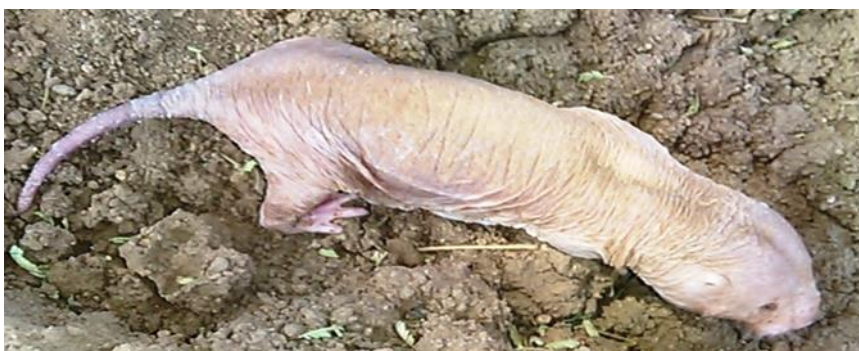
Figure 1 Dorsal view of East African naked mole-rat ( Heterocephalus glaber ) [38]

As shown in Figure 1, naked mole-rats have little or no body hair (hence the common name, naked mole-rat). The only hairs that can be found are touch-sensitive hairs like a cat’s whiskers, which are used for feeling their way through their tunnels and sensing the space around them. Naked mole-rats have cylindrical bodies with short limbs and purplish brown back and tail. Their skin is wrinkled and loose, which helps them to turn in compact spaces or squeeze through the tiniest of tunnels, and allowing them to maneuver around confined spaces [36, 37].