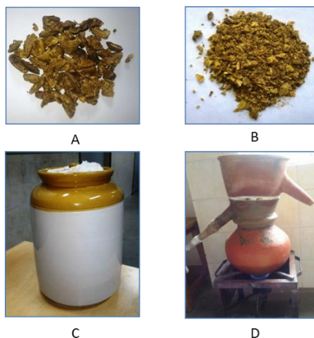
Figure 1 Kadukkai (A-Raw, B- Coarse powder, C- Soaking process, D- Traditional vessel for distillation)

The dry fruit of Terminalia chebula were purchased from a reputed country shop and after it was purified by discarding the seeds, washed and sundried. The pericarp was pounded to coarse powder (figure 1). For about 250g of powder 10 parts of water were added thoroughly mixed and secured for 3 days which accounts the period of soaking. On the 4 th day the entire contents was transferred to a traditional still apparatus for initiating the distillation [8]. The distillate that was collected in another vessel was preserved for analytical studies.