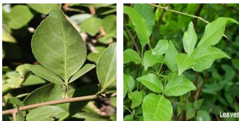
Figure 1 Plant sample leaf and stem

The plant material of Aegle marmelos was collected in the month of June 2019 from the local area of Bangalore, Karnataka, India. The selected plant part removed and then washed under running tap water to remove dirt. The plant sample was then oven dried at 60°C for few days and was crushed in to powder and stored in polythene bags for future use.