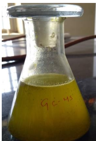
Figure 2 GCMS plant extract preparation

The plant material of Aegle marmelos was collected from wild area, leaf should kept in hot air oven few day for properly dried, after that the dried leaf is pulverized to powder using mechanical grinder, then the required amount plant powder of Aegle marmelos was weighed and transferred to flask, treated with methanol until the powder was fully immersed, incubated overnight and filtrate through Whatmaan filter paper along with sodium sulfate to remove the sediments and trace of water in the filter paper, before filtering, the filter paper along with sodium sulfate was wetted with alcohol. The filtrate is then concentrated to 1 ml by bubbling nitrogen gas into the solution. The extract contains both polar and non-polar components of the plant material and 2 ml of the sample of the solution was employed in GC-MS for analysis of different compounds.