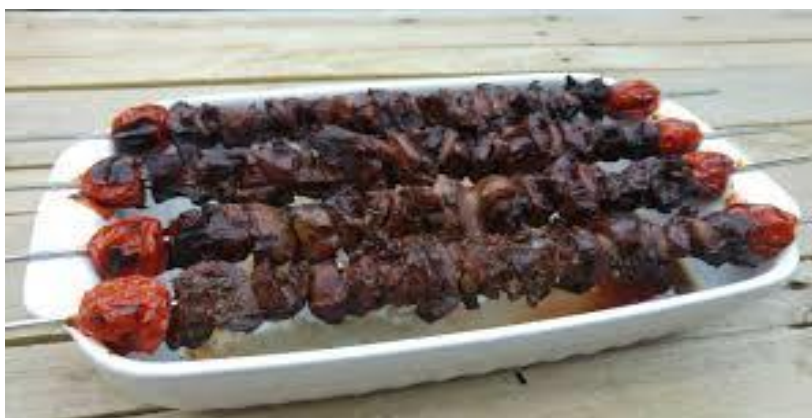
Figure 1 Skewer of ready-to-eat cooked beef

The biological material consists of cooked beef skewers in two commercial forms: hot sold skewers and cold sold skewers (Figure 1). The Samples of cooked beef skewers were collected from vendors in the city of Abidjan mainly in the commune of Adjame.