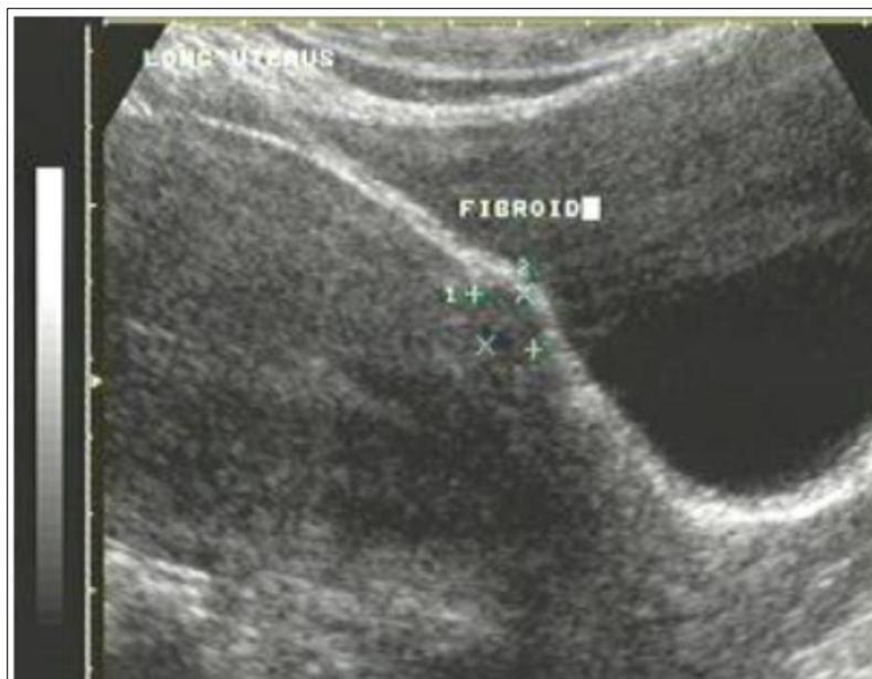
Figure 1 Longitudinal ultrasound scan of the uterus showing a round hypoechoic fibroid located in the anterior aspect of the uterus